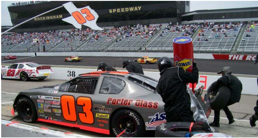
The PGM Team Pulls Off A Fast Pit Stop At Rockingham